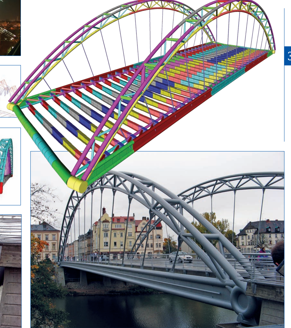
Nemetschek Engineering User Contest 2009 • Category 3: CAE Civil Works